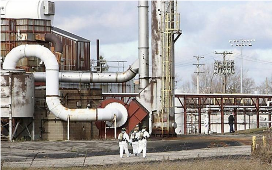
This file photo shows part of the FMC Corp. plant in Middleport. Gov. Andrew Cuomo's office announced that the company has agreed to enter into a $2.4 million settlement tied to the cleanup of contamination in and around the facility.

The state of New York has reached a settlement on the cleanup of arsenic and other hazardous contamination affecting areas in and around the FMC Corp. facility in Middleport.